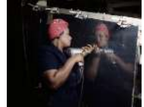
Figure 2: An African-American "Rosie the Riveter" in a bomber plant

African Americans and other minorities also took high-paying industrial jobs previously reserved for whites. In 1941, black labor leader A. Philip Randolph threatened to organize a protest march on Washington, D.C. if the government didn't bar racial discrimination in defense plants with government contracts. Faced with this threat, President Roosevelt banned such discrimination and created the Fair Employment Practices Commission (FEPC) to investigate bias charges.