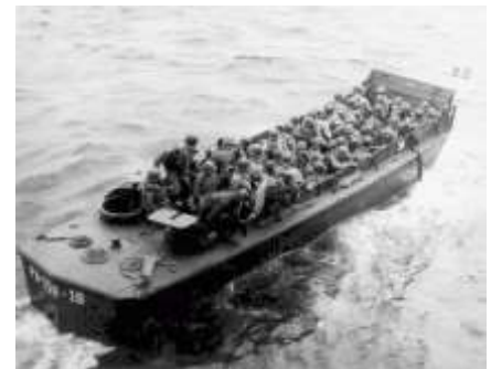
Figure 3: Higgins Landing Craft

The first was landing craft, constructed of wood and steel and used to transport fully armed troops, light tanks, field artillery, and other mechanized equipment and supplies to shore. These boats helped make the amphibious landings of World War II possible.