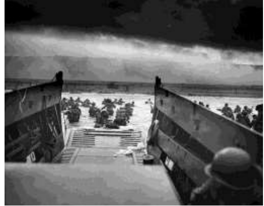
Figure 4: View from a Higgins Boat on D-Day

Excerpt retrieved from: http://www.nationalww2museum.org/learn/education/for-students/ww2-history/america-goes-to-war.html