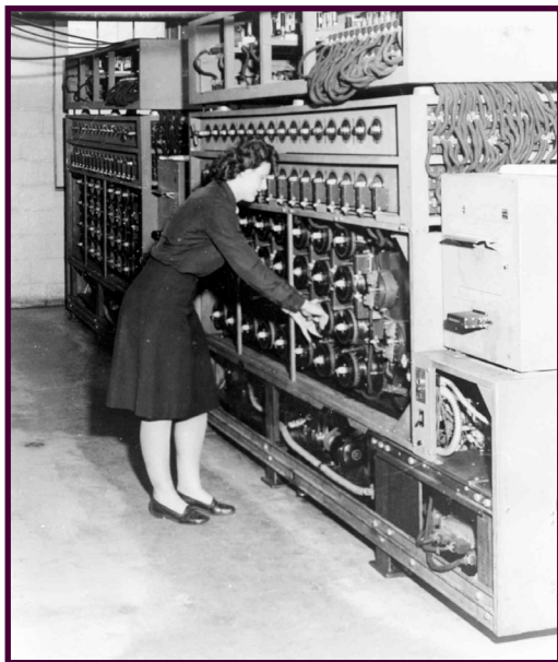
The N-530 Bombe, located on the second deck of building 4 (Photo dated 15 May 1945)

dered the other side. This arrangement maintained the secrecy of the rotor wirings. No WAVE would have knowledge of both sides of any rotor.