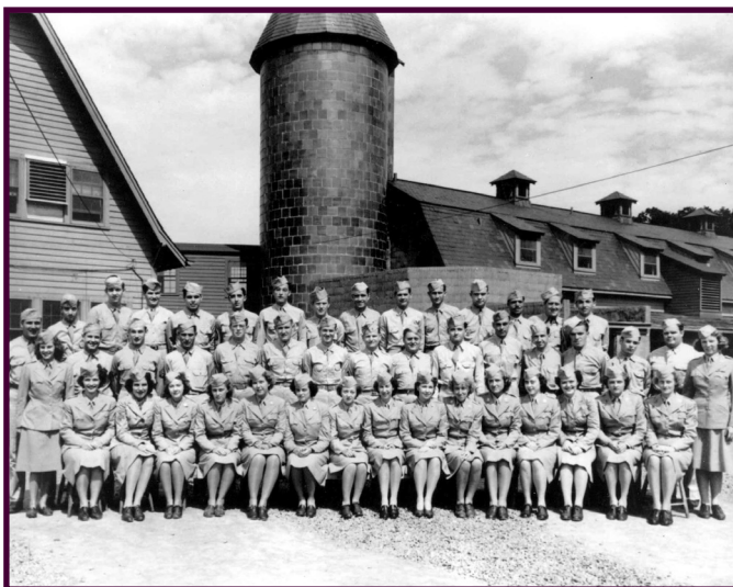
Operations trick, and Signal Service Battallion (soldiers and Waves), approximately 1943. The battalion was located in Vint Hill Farms Station, Virginia. (Note the barn in the background.)

tions practices which would make it easier for the enemy to decrypt U.S. messages.